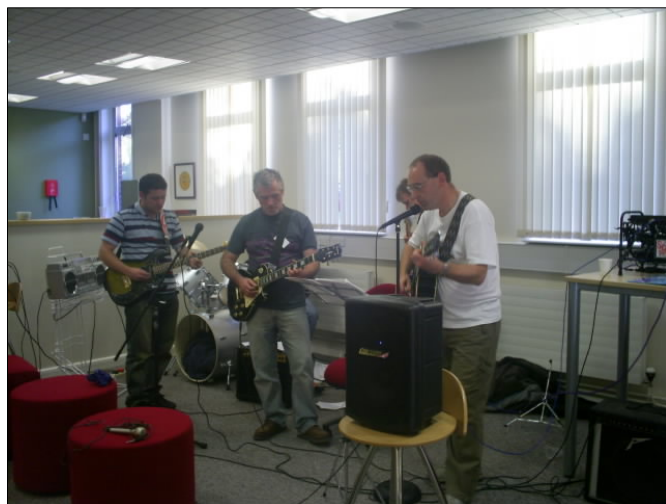
'Screwloose' in action